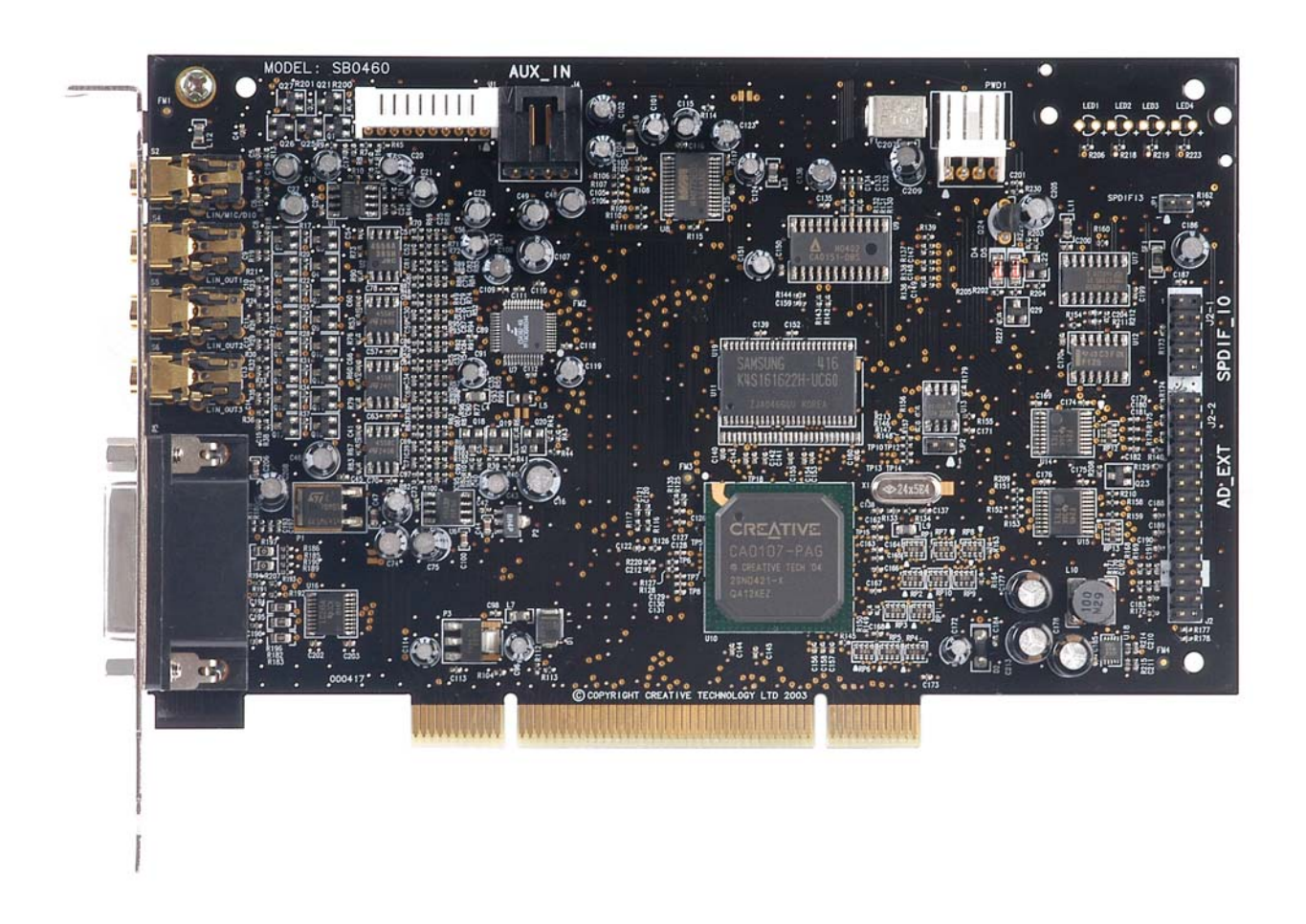
Figure 1: SB X-Fi SB0460 Card

It has been reported that people hearing the first gramophone recordings described the resulting sound as indistinguishable from the live original. Over the ensuing century of audio technology development, a similar phenomenon has been repeatedly observed: people are almost universally satisfied with whatever audio reproduction technology they've grown accustomed to... until they are offered something better. Almost overnight, the old technology then becomes unacceptable, and the new technology becomes the standard that everyone aspires to.